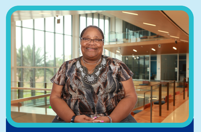
Retired Volusia teacher (ELA/Reading/Writing)