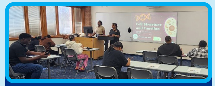
Bethune-Cookman University students working with collaborative science groups.

All Upward Bound students have access to professional tutors who specialize in English, Writing, Science, Math, and test prep. In addition, on-line tutoring support is available 24/7 through a contracted service. Professional tutors are available during student lunches, after school, and during Saturday workshops. Tutors offer support with student homework, classwork, upcoming assessments and remediation opportunities, and college readiness prep, including college essay structure, personal statements and college applications.